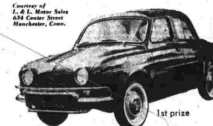
Courtesy of E. & L. Motor Sales 618 Center Street Manchester, Conn.

$1695 Renault 1959 Dauphine sedan The largest-selling imported 4-door sedan in America. 35 miles per gallon... seats family of 5 comfortably. See it on exhibition at J. M. Fields king-size parking lot.