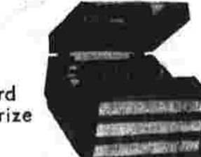
119.50 V-M Table Model Hi-Fi Phonograph

Come in to J. M. Fields and get your official free entry blank for easy line-up contest. Nothing to buy—just finish the last line (to rhyme with first two lines). Enter as often as you wish. Contest ends next Feb. 28. Prizes will be awarded in 1969. No cash prize. All entries must be submitted to J. M. Fields, 820 Silver Lane, East Hartford, Conn. 06108. All entries must be submitted on the contest entry blank available at J. M. Fields.